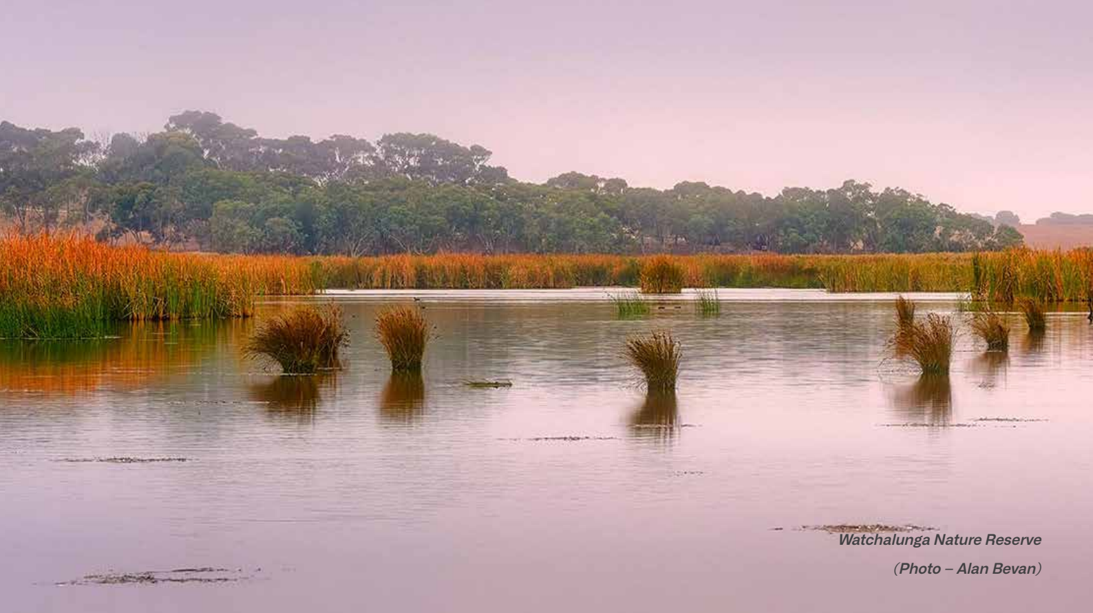
Watchalunga Nature Reserve