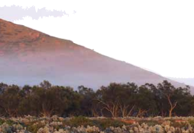
Sunrise at Hiltaba Nature Reserve