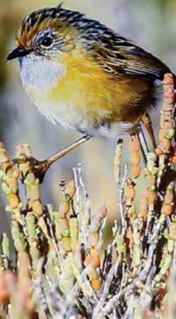
Mount Lofty Ranges Southern Emu-wren at Watchalunga Nature Reserve