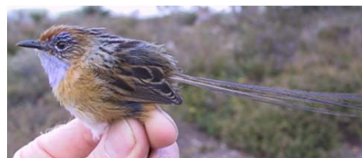
Mt Lofty Southern Emu-wren

Swamps of the Fleurieu Peninsula are listed as a critically endangered ecological community under the Environment Protection and Biodiversity Conservation (EPBC) Act 1999 . The property contains two confirmed EPBC listed species, the Mount Lofty Ranges Southern Emu-wren (endangered) and the Southern Bell Frog (vulnerable). The waters also contain high numbers of native fish (13 have been recorded) and may still be a refuge for the Yarra Pygmy Perch (vulnerable), and the Murray hardyhead (vulnerable). Previous flora (plant) surveys have identified 31 indigenous species with more species likely to occur with more thorough inspections.