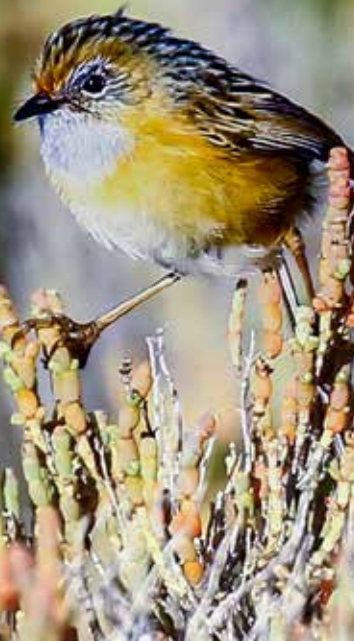
Mount Lofty Ranges Southern Emu-wren at Watchalunga Nature Reserve.

A gift to Nature Foundation in your Will can assist us to protect these critically endangered birds at Watchalunga Nature Reserve.