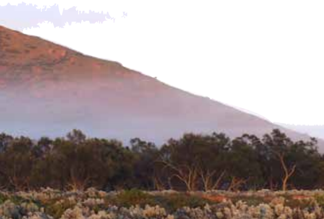
Sunrise at Hiltaba Nature Reserve

A gift to Nature Foundation in your Will can help us acquire and restore more properties like Hiltaba to provide a safe haven for threatened species such as the Yellow-footed Rock-wallaby.