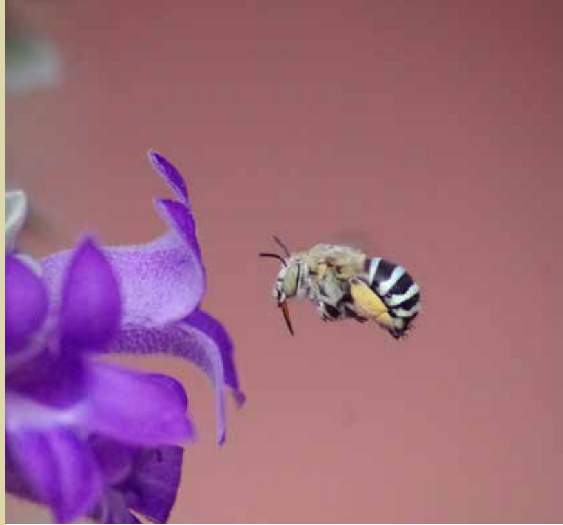
Native Blue Banded Bee at Hiltaba Nature Reserve

You can give your entire estate to Nature Foundation if you want to achieve something very significant with your gift.